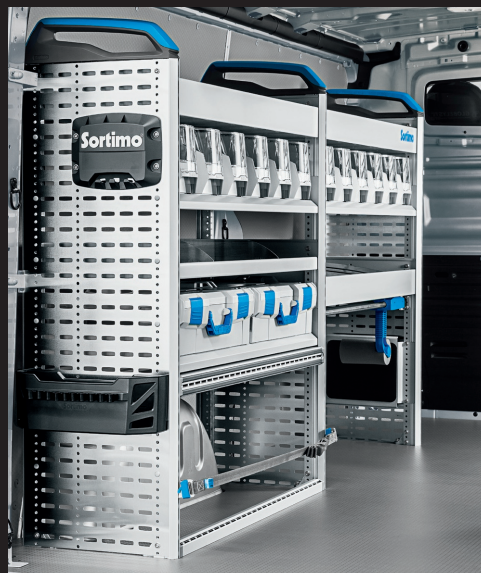
Equipment block on the left-hand side of the loading area.