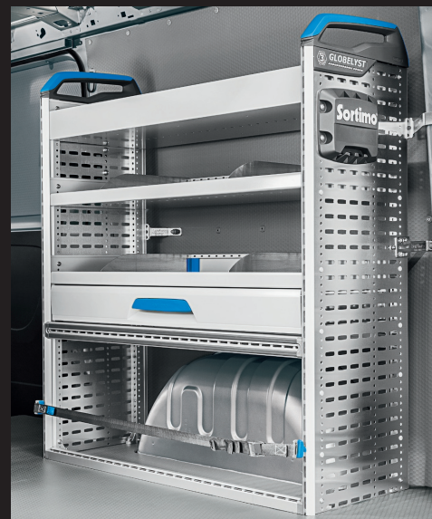
Equipment block on the right-hand side of the loading area.