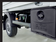
Polyethylene storage box