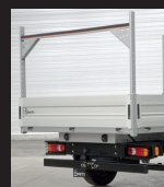
Rear ladder holder