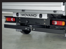
Rear under-run bar with towing hitch