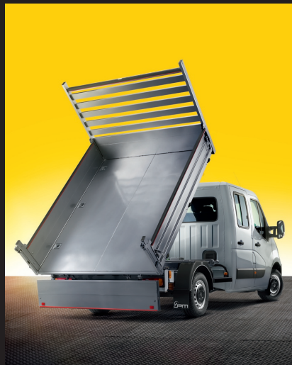
Full alloy rear tipper