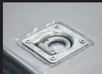
Lashing points in floor